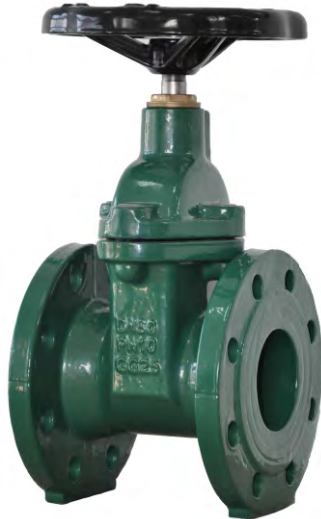
Fig. 3246 (DIN F4) 3247 (DIN F5)