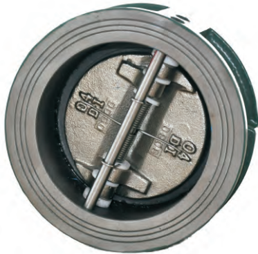
Fig. 5306H (DIN3202)