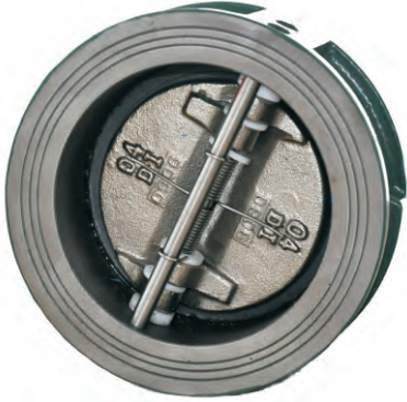
Fig. DDCV5306 (DIN3202)